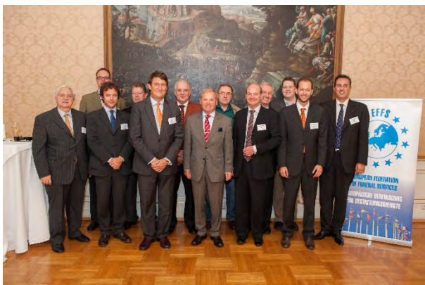
Board members and guests

We started things off the previous day with a very constructive Board meeting.